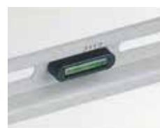
Built in wall bar level