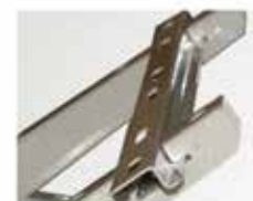
Advanced Crossbar allows for even faster installation