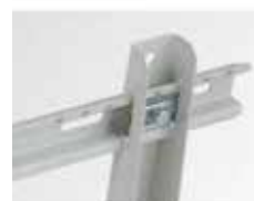
Easy assembly continues our tradition of quick installation