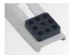
Adjustable anti-vibration cushions with captive nut

Information correct at time of going to press.