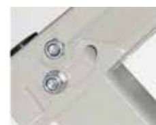
Hinged bracket arms for fast installation