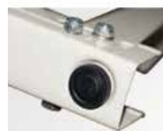
Adjustment bolt provides up to 5 degrees of correction