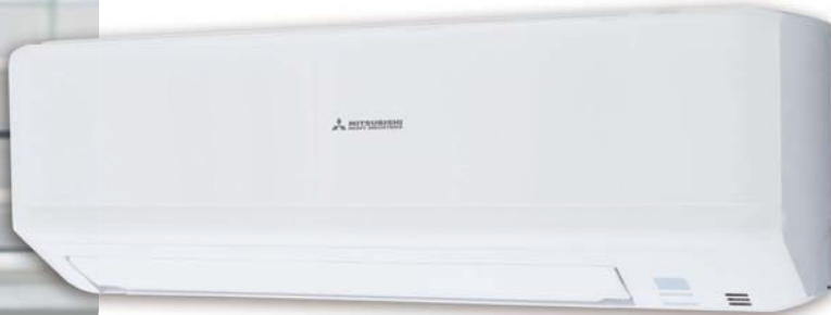
SRK25ZSP-W, SRK35ZSP-W, SRK45ZSP-W