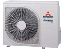
SRC20ZSX-W, SRC25ZSX-W, SRC35ZSX-W, SRC50ZSX-W1, SRC60ZSX-W1